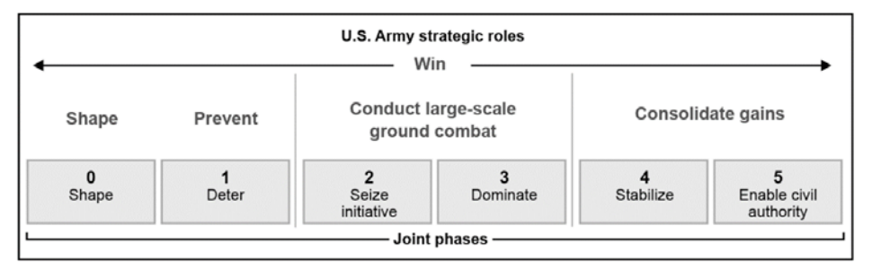
Figure C-1. Army strategic roles and their relationships to joint phases

C-1. Phasing is a way to view and conduct a complex operation in manageable parts and can be indicated by time, distance, terrain, or event. A phase is a planning and execution tool used to divide an operation in duration and activity (ADRP 3-0). An operational phase is characterized by the "focus" that is placed on it. A change in phase (transition) usually involves a combination of changes of mission, task organization, priorities of support, or rules of engagement. Phases are not concrete timelines. Joint operations might experience multiple phases conducted simultaneously with commanders compressing, expanding, or omitting a phase entirely. The Army's mission is to provide land forces in support of the joint force; the Army's strategic roles (Chapter 1 of this document) generally align with the joint phases, see JP 3-0, JP 5-0, ADRP 5-0, and FM 3-0.