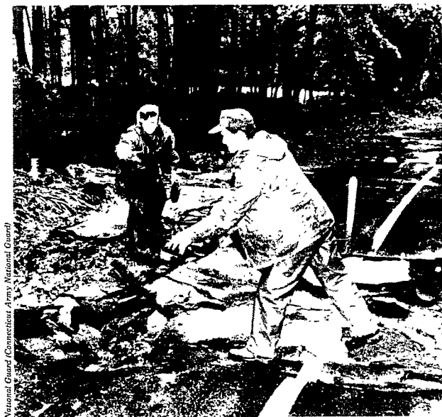
National Guard (Connecticut Army National Guard)